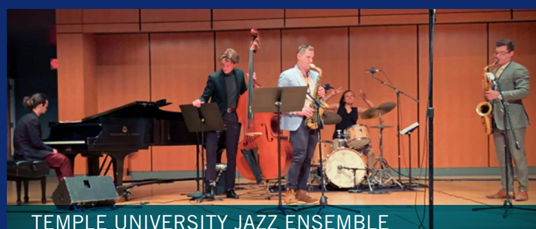
TEMPLE UNIVERSITY JAZZ ENSEMBLE